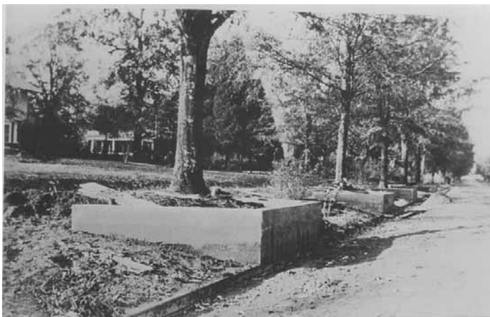
Last week's answer: This is the Myers Park Neighborhood.