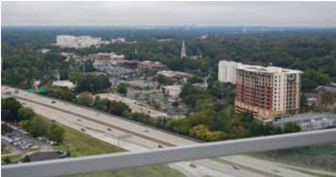
How many exits are there on I-277 northbound?